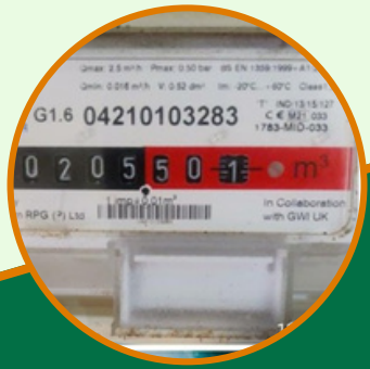
Improvement over inaccurate meter readings