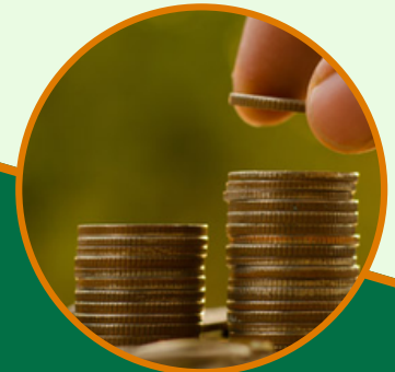
70% Cost savings in overall cycle time