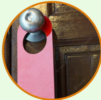
20% efficient in improving door lock conditions