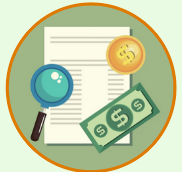
20% of billing cycle inefficiencies solved